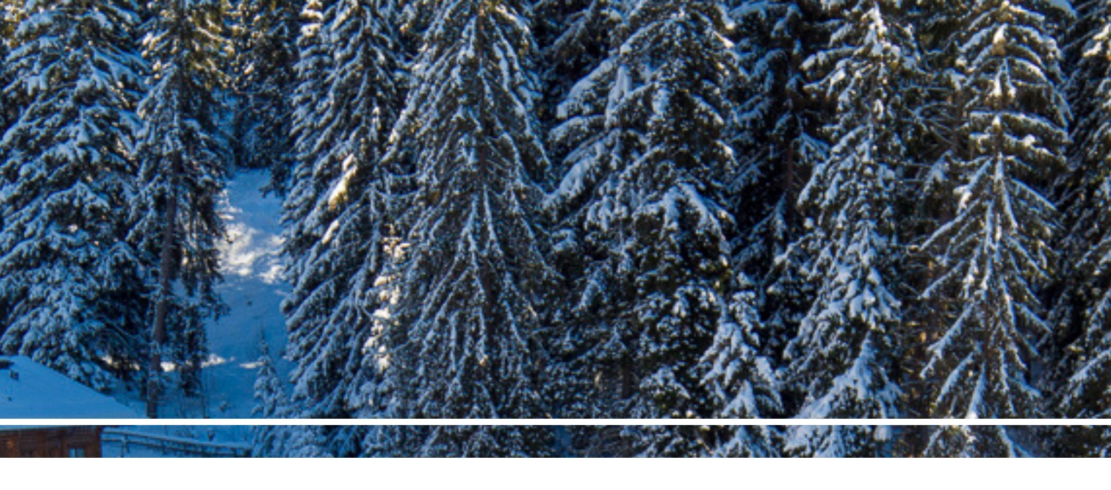
CHALET SOROJASA SLEEPS 10